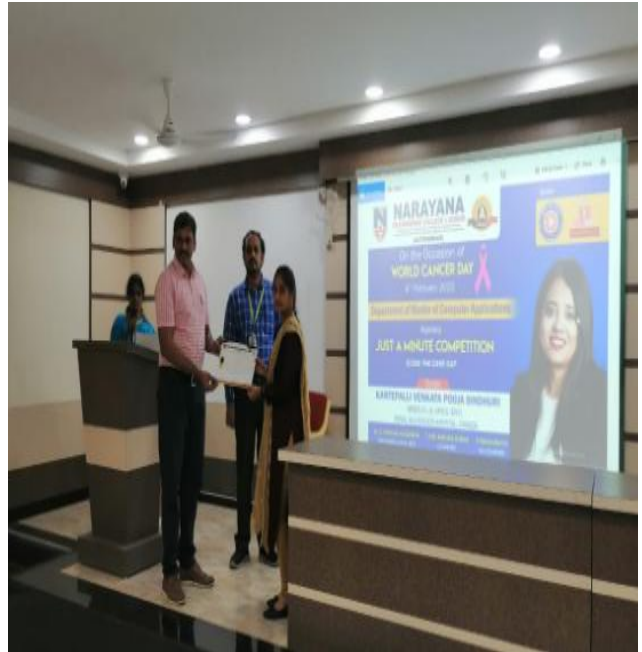
Distribution of Prizes to the Winners by Our beloved Principal