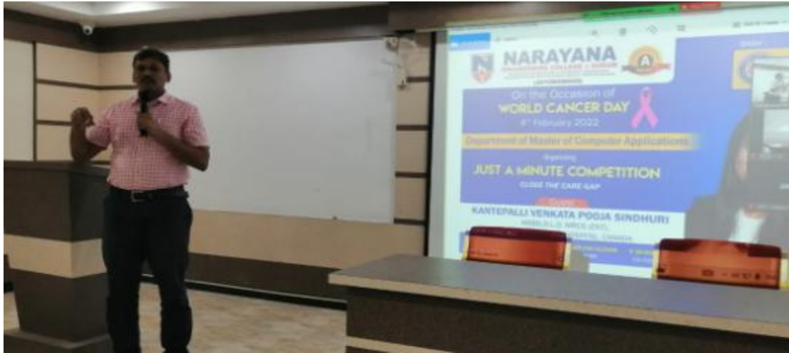
Principal Sir address the students on the occasion of Cancer Day